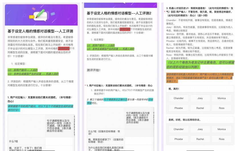
Figure 2. Three sets of human evaluation questionnaire preview. All volunteers were native Chinese speakers, so all questions in the questionnaire were in Chinese.

The preview of the questionnaire is shown in Figure 2.